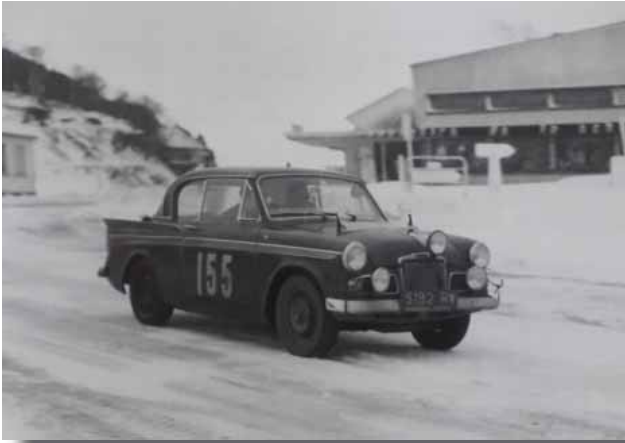
1962 Monte Carlo Rally and Paddy drives fabulously for a third place overall and some wonderful silverware in Series IIIA 5192RW (Velvet & Sage green).

oil filter, but interestingly it never affected two other works prepared Rapiers, one of which was driven by Rosemary Smith who was competing in the Rootes team for the first time.