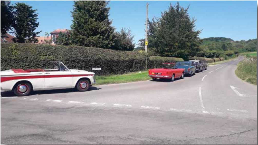
The foot of Kop Hill road in the Chilterns and a selection of Rootes finest wait to try their hand.....

In the afternoon we took a nice countryside drive out to Buckinghamshire and the lovely hillsides of the Chilterns. Close to the Prime Minister's country retreat at Chequers nestles Princes Risborough, a small village that in the 1920s hosted regular hill climb events on its famous Kop Hill, an almost straight half mile road rising from the valley below. The idea in the day was to see how fast you could reach the top, according to Wikipedia the record is some 22 secs, which for a car 100 years ago was amazing. A weekend in mid-September is now set aside to emulate those events and great fun it is too. Nowadays speed gives way to showmanship, as veteran cars with Edwardian clad ladies and gents puff up the hill followed by supercars leaving rubber trails on the tarmac; nobody is now timed.