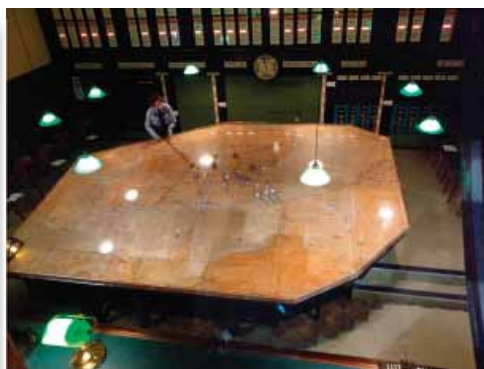
Inside the Bunker

Often referred to as the “Dowding System” after Air Chief Marshall Sir Hugh Dowding, who was Commander in Chief Fighter Command at the time, the bunker was the centre of the world’s first integrated air defence system, linking Fighter Command with all the other essential parts of the chain: Anti-Aircraft Command, Barrage Balloon Command, Observer Corp, the radar installations along the coast and the intelligence services. All of these successfully worked together to ensure our airspace was preserved and ultimately to achieve victory in the Battle of Britain.