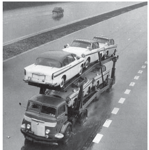
New unregistered models would be loaded onto transporters and shipped to fulfil orders at the various worldwide dealers.