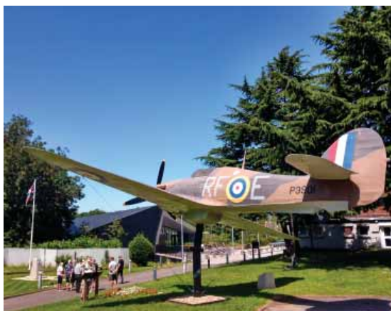
Adorning the entrance to RAF Uxbridge

My maternal grandparents bought their house off plans in 1938 in Riddlesdown near Purley. It was a new housing development and building was stopped for the duration of the war with their house being the last pre-war one finished in their road, with the rest not being built until the 1960s. My grandmother used to walk up on Riddlesdown downs during the war and when I was younger told me whenever she saw the Germans fly over, she would run back home to get into the Anderson shelter in their garden. Their roof was blown off three times during the war which my grandmother explained was because they were right smack in the middle of the RAF bases at Kenley, Biggin Hill and Croydon so were a prime target. She used to joke that after the third time they put the roof back on properly and it would never come off again. And she was right because in the 1987 hurricane it didn't budge...!! I also remember she showed me a crater on the downs where she saw a Spitfire crash.