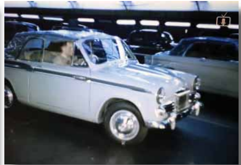
Eventually streams of shiny new Minxes, Gazelles and Rapiers would emerge (in no particular order), fully completed, from the Ryton production line.