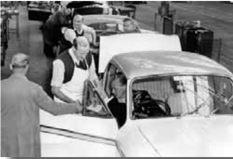
Back at Ryton and almost nearing completion.