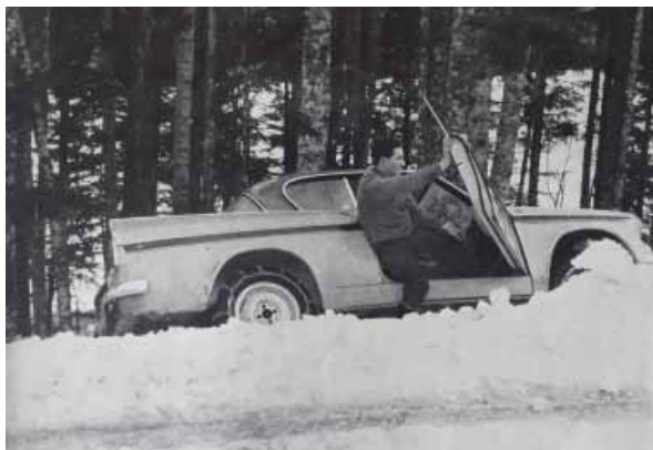
An unfortunate Paddy with YWK3 well and truly stuck in snow on the final Mountain Stage of the 1960 Monte Carlo Rally.

For 1960 the Rootes Team would showcase the Series III model and their famous YWK rally cars. The first major event of the rally season was the Rallye Monte Carlo and Paddy and Jack were given YWK3 (in Powder & Corinth blue) with the hope that its increased power, front disc brakes and new Dunlop "Duraband" radials would make them highly competitive. Although unpenalized when they arrived at Monaco, the pair left the road and got stuck in snow on the final 350-mile regularity Mountain Circuit test.